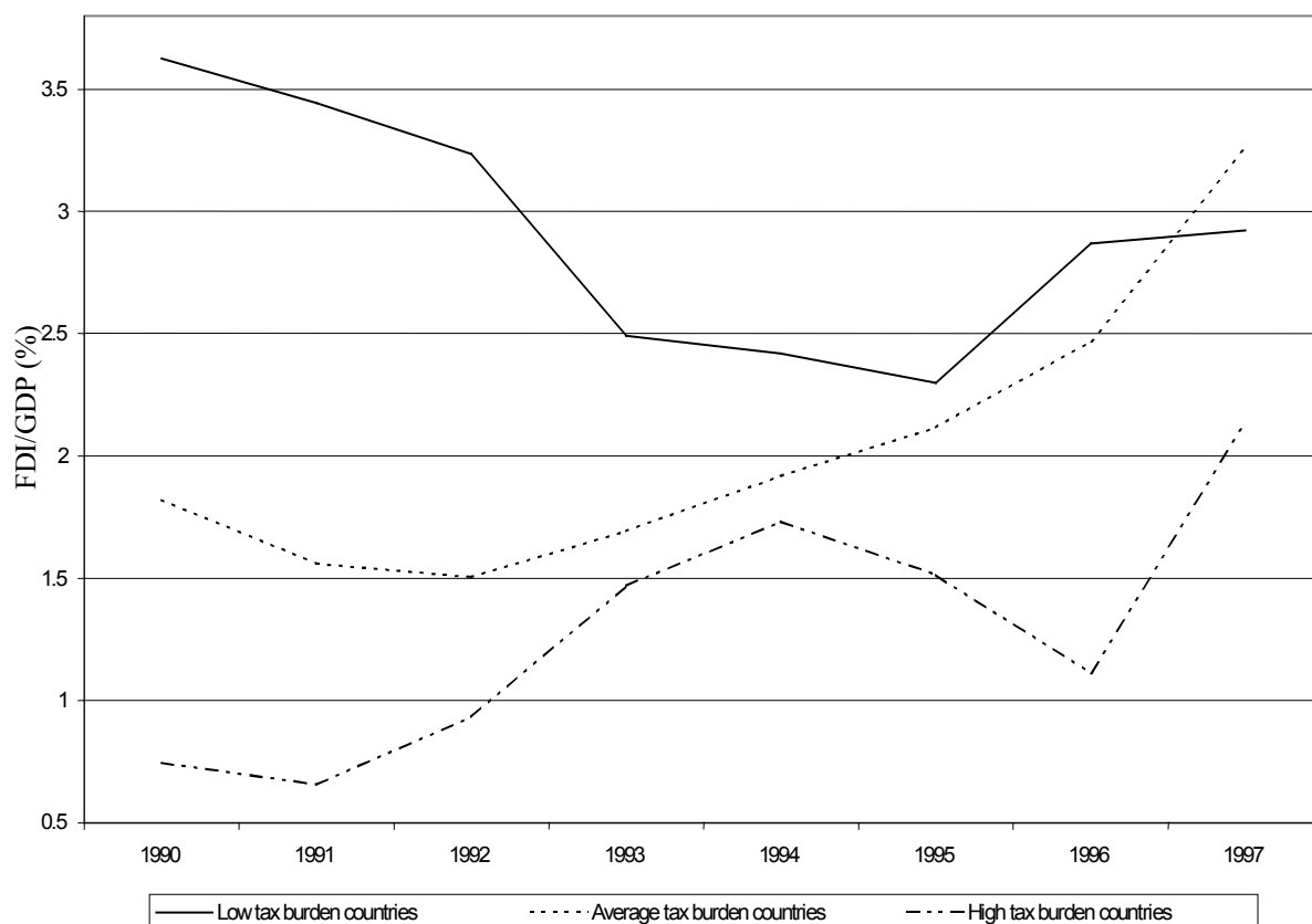
FDI inflows and tax burden (three years moving averages)

1 The chart reports for each year the averages of FDI inflows divided by GDP (%). Low tax burden countries are: Greece, Ireland, Portugal, United Kingdom and Spain; medium tax burden countries are: Austria, Belgium, France, Germany, Italy, Netherlands and Finland; high tax burden countries are Denmark and Sweden.